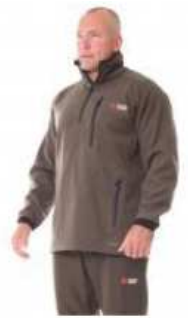
The Rock Pullover

More in store, including the "George River" pants, "Attitude" Jacket and "Stow-it" jacket as viewed on the "Stoney Creek" social night