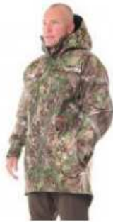
The Stillwater Jacket