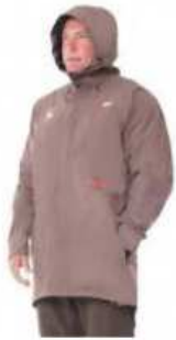
The Glaisnock Jacket

Outdoorsman Headquarters has the new Wapiti Foundation range of Stoney Creek clothing