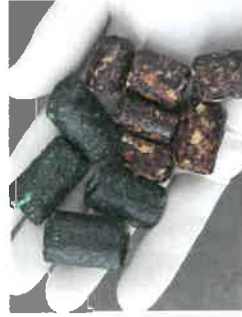
Baits covered in deer repellent. The non-toxic pre-feed pellets are brownish-tan while the toxic baits are green.

A vast majority of possum control in the region is done by local contractors using ground-based traps and hand-laid toxins. The remaining area is controlled using aerially applied pellets containing biodegradable 1080. Aerial control is highly-efficient, cost-effective and has historically been extremely successful at knocking possum numbers down to very low levels. It is preferred in areas like Southern Rimutaka due to the rugged nature of the terrain. The Parliamentary Commissioner for the Environment also supports aerial